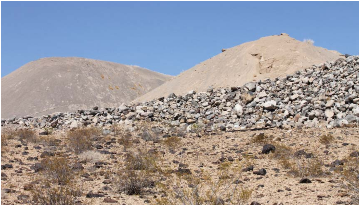
Example of mineral materials sold by BLM through the mineral materials program

BLM sells mineral materials under the authority of the Materials Act of 1947, as amended. These materials consist of common types of sand and gravel, stone, pumice, or other materials used primarily in construction and landscaping, and are mainly sold using competitive or noncompetitive contracts. In fiscal year 2011, sales were valued at approximately $17 million; we visited eight field offices in four States whose fiscal year 2011 sales totaled more than $14 million. We found little assurance that BLM obtained market value for mineral sales, recovered the processing cost for mineral contracts, verified sales production, or resolved issues of unauthorized mineral use.