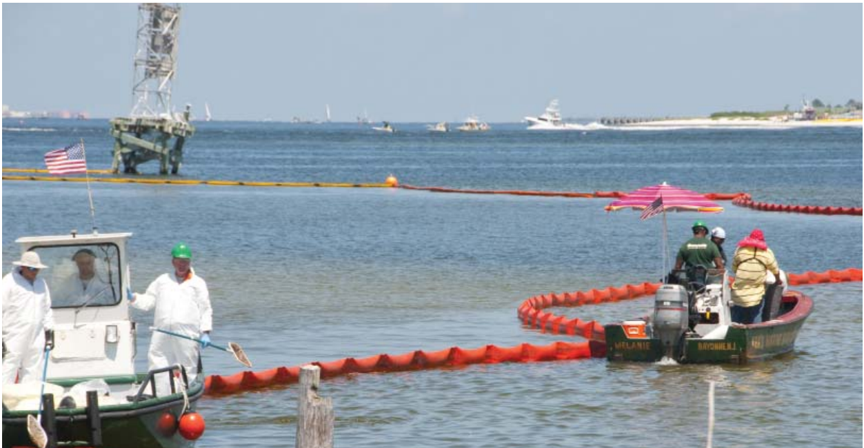
Cleanup efforts in the Gulf of Mexico following the Deepwater Horizon explosion and oil spill

As a result of the task force's investigation, three companies—BP, Transocean, and Halliburton—have pleaded guilty and paid almost $4.5 billion in fines, penalties, and contributions. In November 2012, BP agreed to plead guilty to 11 counts of manslaughter, 1 count of obstruction of Congress, and 2 other charges. They also agreed to pay $1.26 billion in criminal fines and another $2.74 billion in penalties. Two months later, Transocean, the drilling contractor that owned the Deepwater Horizon , pleaded guilty to one criminal charge and agreed to pay $400 million in criminal fines and penalties. Lastly, in September 2013, Halliburton, which provided contract cementing services to BP, pleaded guilty to a charge concerning the destruction of evidence and paid the maximum statutory fine of $200,000. Halliburton also made a voluntary and unconditional contribution of $55 million to the National Fish and Wildlife Foundation.