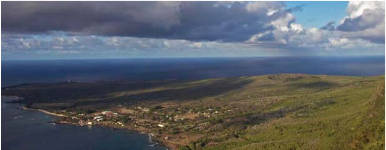
Kalaupapa National Historic Park in Hawaii