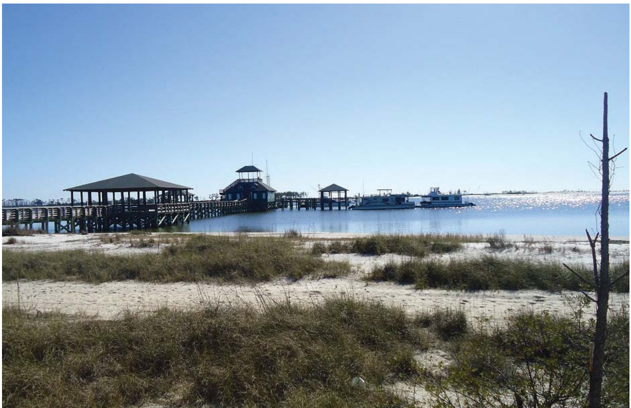
The Gulf of Mexico from a beach near Biloxi, MS

We disagree with the position of both FWS and PMB. While these projects may provide a public good and may deserve public funding, we do not believe there is sufficient justification for CIAP to provide that funding. We acknowledge that certain aspects of these projects do appear to meet the requirements under AU1, such as the planting of native vegetation or coastal conservation, but these aspects often represent a minor portion of the overall funding. The fact that a small portion of a project may serve for the conservation, protection, or restoration of coastal areas does not justify substantial additional funding that falls outside of those parameters, causing us to question whether any of these projects that we initially determined to provide little or no direct benefit to the natural coastal environment were designed or completed in the spirit of the Act.