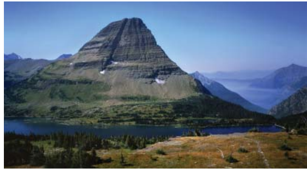
Glacier National Park, Montana

In this semiannual report, I am pleased to submit a summary highlighting the Office of Inspector General's dedicated and successful work covering the 6-month period from October 1, 2013, through March 31, 2014.