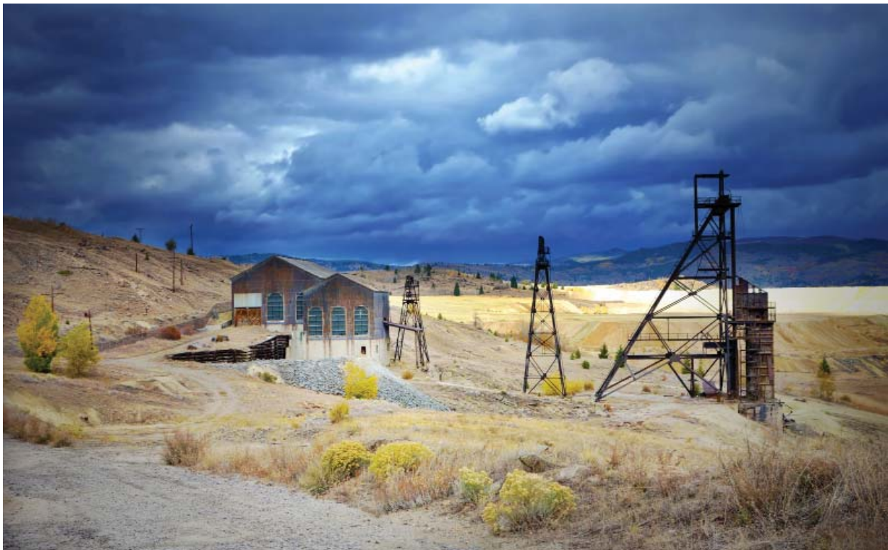
Old mine headframe in Butte, MT